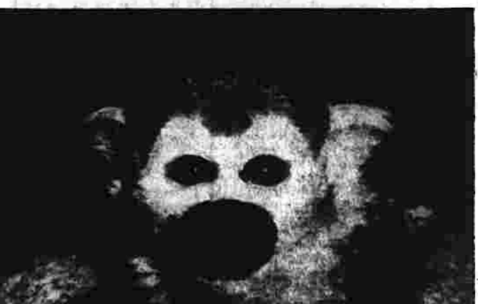
This is a squirrel monkey, described by Capt. Norman Lee Barrey as the monkey that was launched today from Cape Canaveral, Fla.

Washington, Dec. 13 (AP)—The Army flung a tiny monkey into space today but lost it in the South Atlantic. Six hours after the monkey began its journey in the nose cone of a Jupiter intermediate range ballistic missile the Army announced that the search for the little space traveler had been abandoned.