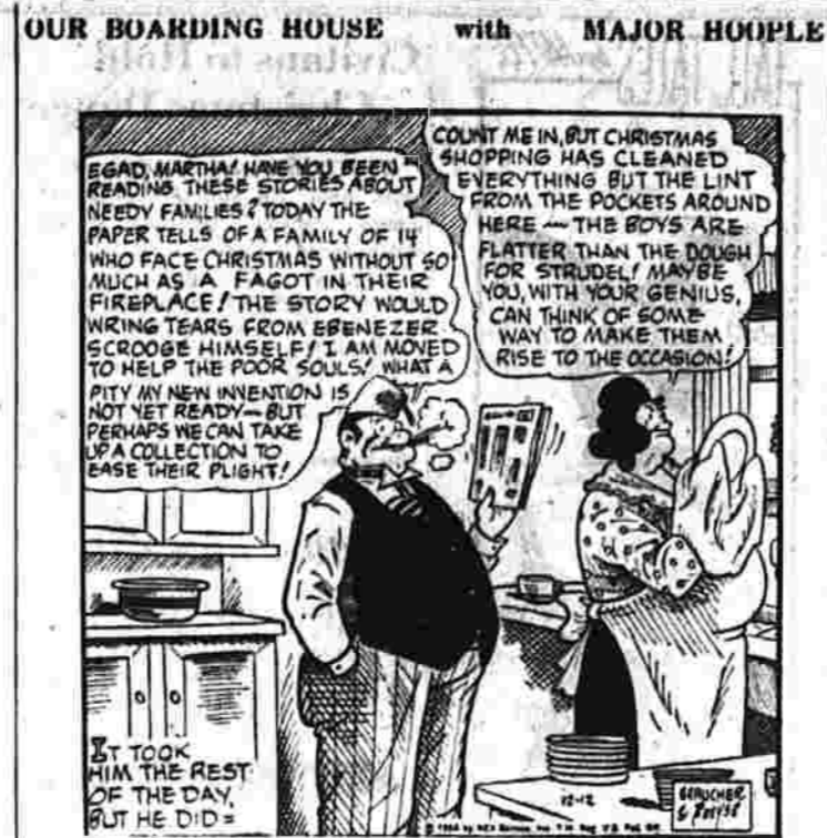
OUR BOARDING HOUSE